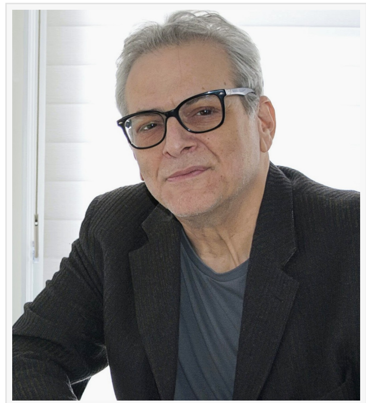
Richard Behar, author of "Madoff: The Final Word"

The journalist's extensive research included reviewing over 100,000 pages of documents and interviewing more than 300 sources, including federal regulators, prosecutors, and SEC agents.