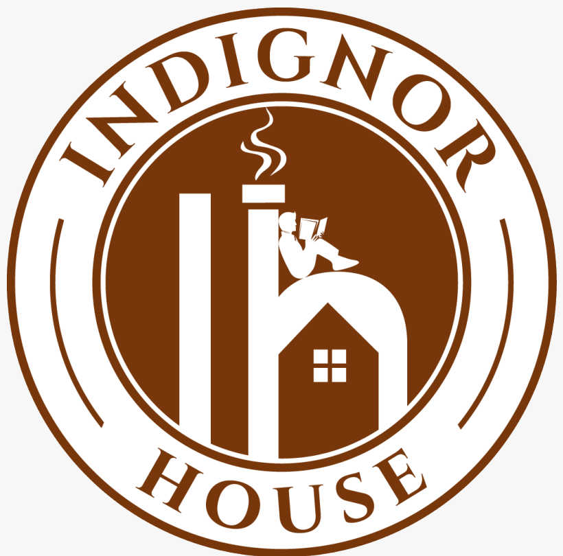
Indignor House Logo