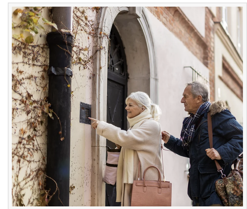
Why wait - let's do this!

Financial Security: By receiving the majority of their home's equity upfront, seniors can cover the initial costs of