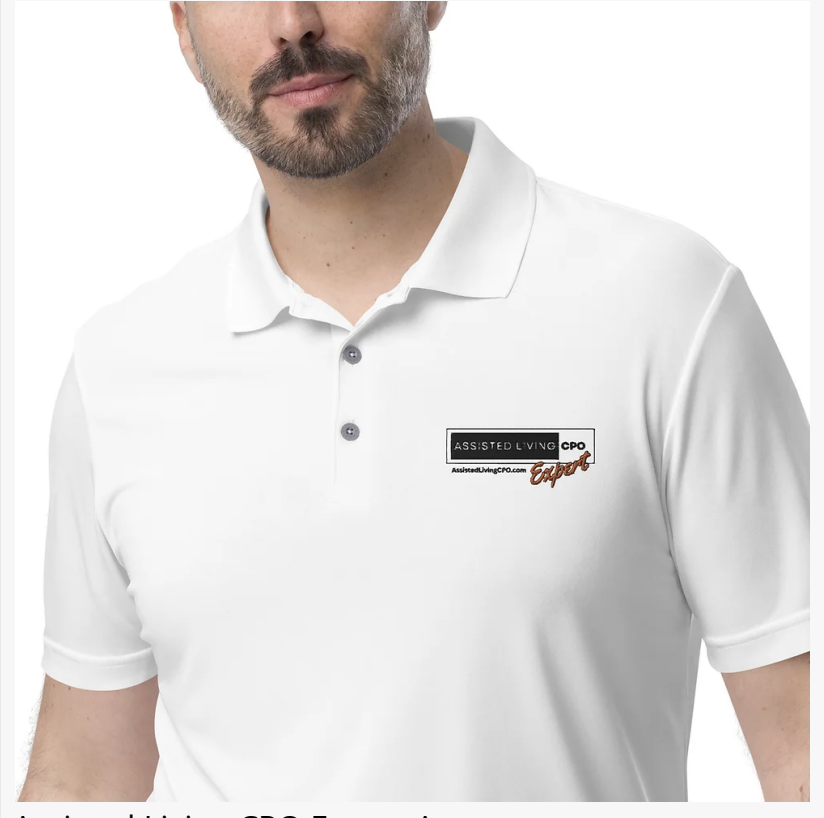
Assisted Living CPO Expert Agents

moving and settling into their new assisted living community.