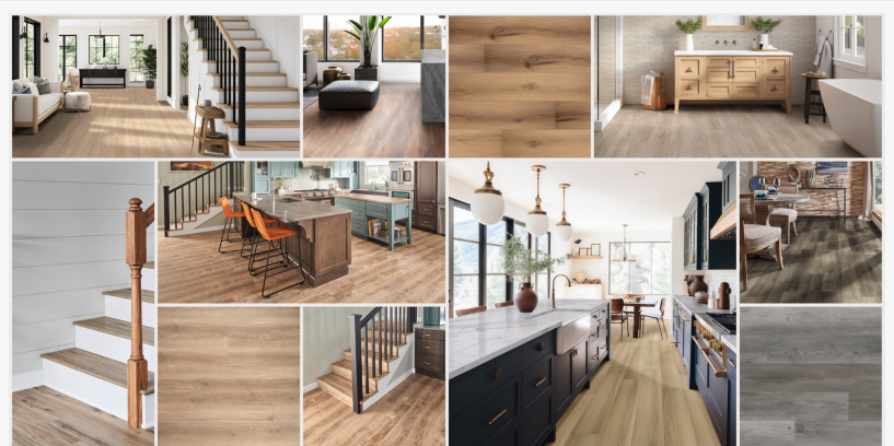
Bedford and Bend LVP

LVP is comprised of several layers of material topped with a protective wear layer that lends to the durability of the planks or tiles. Architessa first introduced LVP products to their product offerings in 2019 and has since been gradually expanding LVP and LVT options.