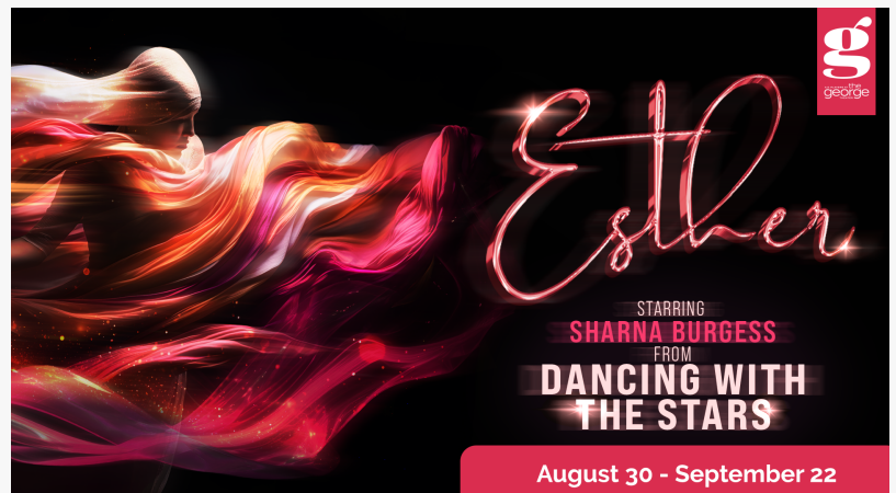
Esther a new dance musical