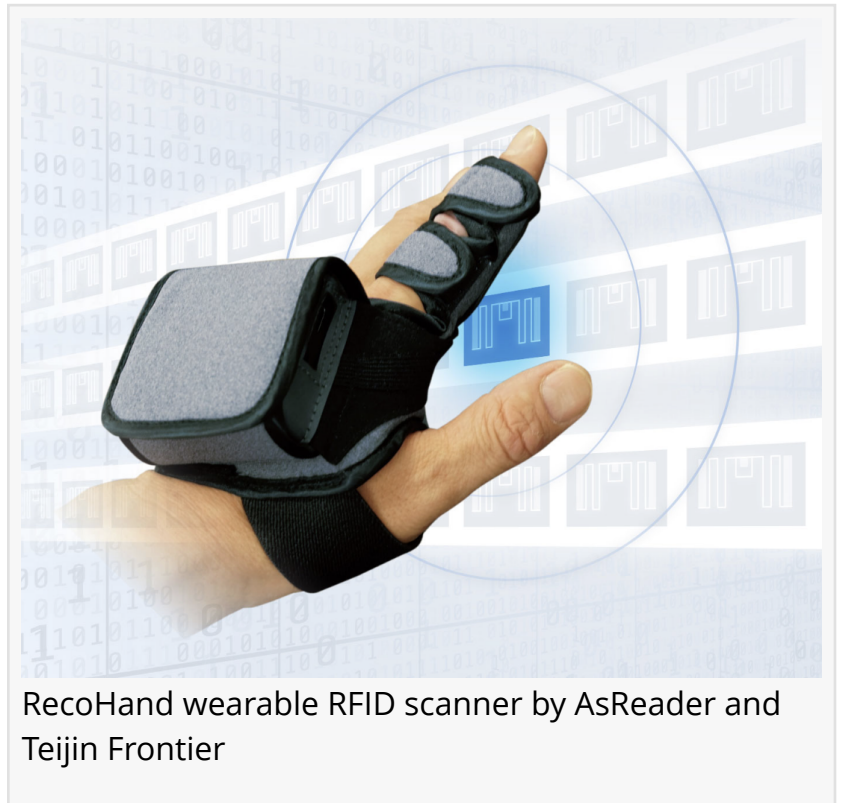
RecoHand wearable RFID scanner by AsReader and Teijin Frontier

PORTLAND, OREGON, UNITED STATES, July 19, 2024 /EINPresswire.com/ -- A new Wearable RFID device from two Japan-based tech manufacturers — AsReader and Teijin Frontier — is making waves having just achieved FCC/FDA approval in the USA. The device, called RecoHand™ , has been shown to manufacturers, logistics and material handling companies and retail giants at several 2024 tradeshows in the USA and UK, including RFID Journal LIVE! 2024, National Retail Federation (NRF24), MODEX2024 and Retail Technology Show (RTS24) in London. Interest in RecoHand has turned to momentum as the device is now shipping to customers after joining the winners circle at RFID Journal LIVE! as a finalist for Best New Product of 2024 award.