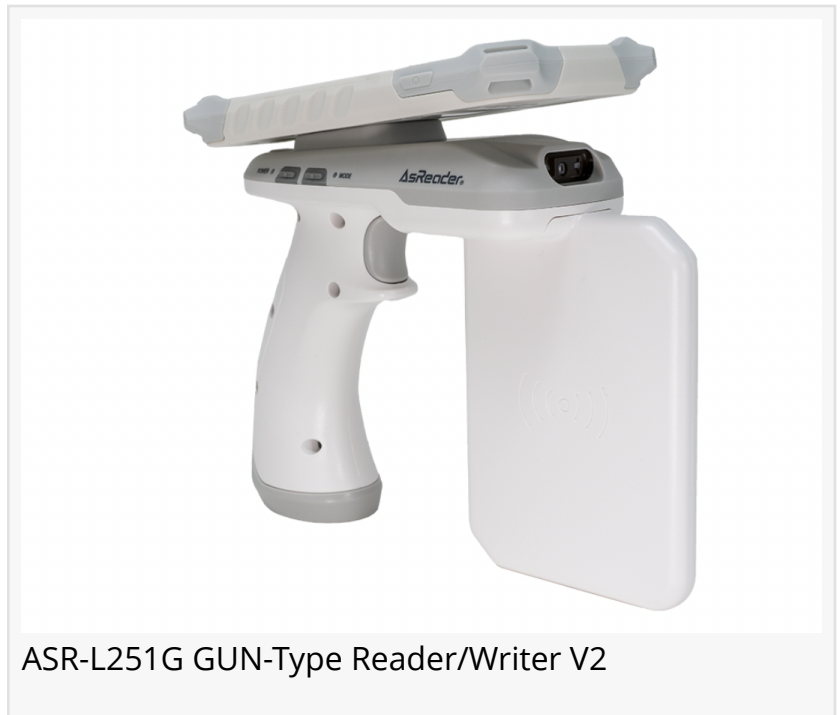
ASR-L251G GUN-Type Reader/Writer V2

Another problem that RecoHand solves is for logistics, transportation and delivery customers who have found that while delivering packages on "the last mile" and when the delivery vehicle is packed full of packages, if a product is at the package in the back of the van, it can be difficult to find.