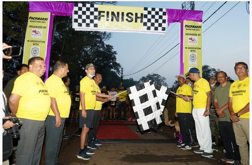
A Glimpse from the Past Pachmarhi Monsoon Marathon