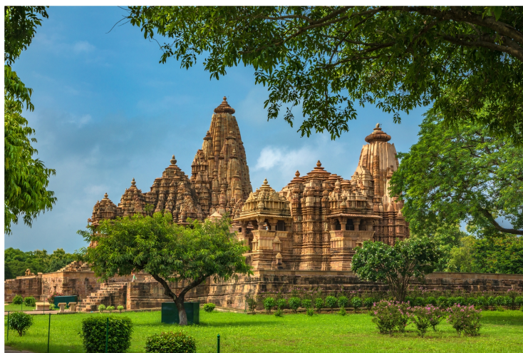
Khajuraho Group of Monuments - a UNESCO World Heritage Site