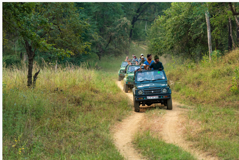
Jungle Safari at Satpura Forest

According to the tourism department, several intra-state cruises are in the works, including routes from Miakal Resort in Bargi near Jabalpur to Tindini in Mandla district, from Dharaji in Dewas to Sailani Tapu east of Omkareshwar, and from Sanjit village to the tent city of Gandhi Sagar. The Tawa-Madhai cruise is also expected to receive