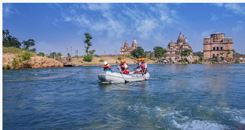
River Rafting - Orchha