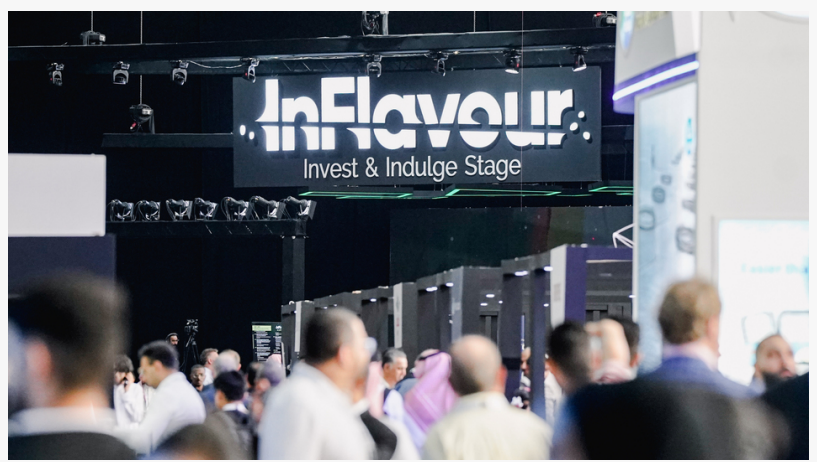
The show's second iteration will run from October 1-3