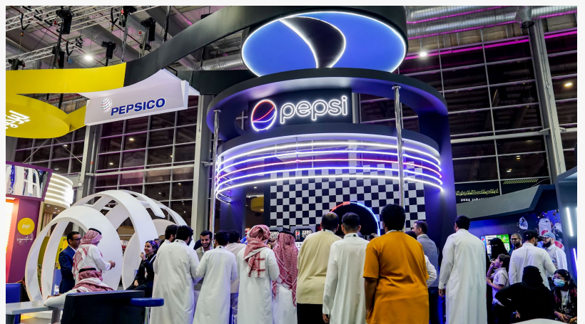
Second iteration of Saudi's most influential government-backed F&B event to take place from October 1-3 with aim of building on overwhelming success of last year's show