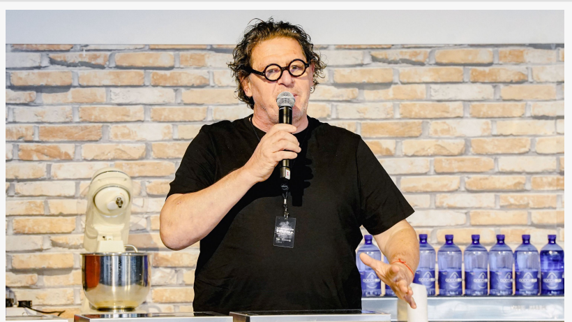
Celebrity Chef Marco Pierre White Took Center Stage at the Inaugural InFlavour 2023

innovators by facilitating trade between key decision-makers, investors, buyers, and entrepreneurs as well as transcending the culture of food through InFlavour's on-site experiences. Global industry disruptors and pioneers will take to the event's multiple stages to deliver thought-provoking insights on the sector's hottest topics and try to inspire change.