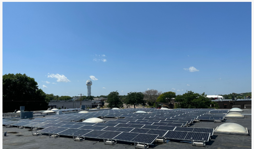
Wolf River Commercial Solar Ground Mount