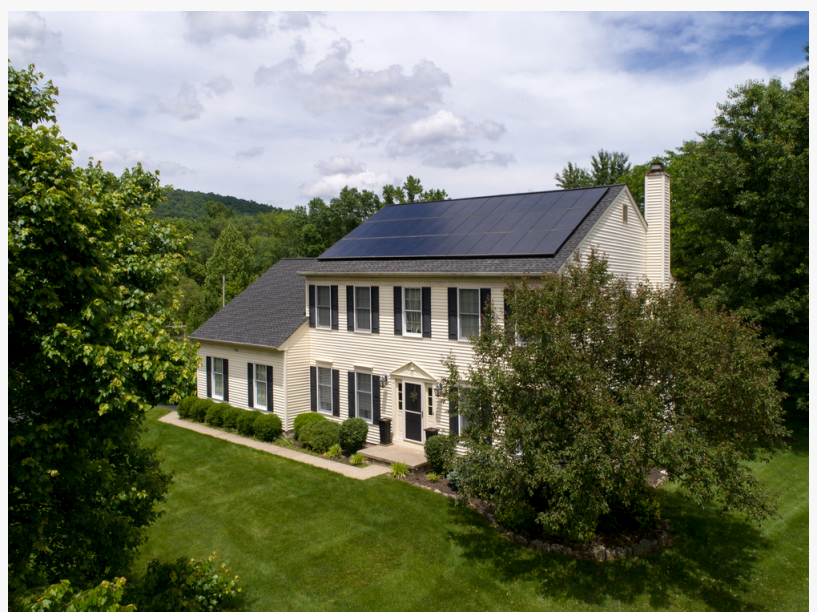
Midwest house with Wolf River Solar Installation