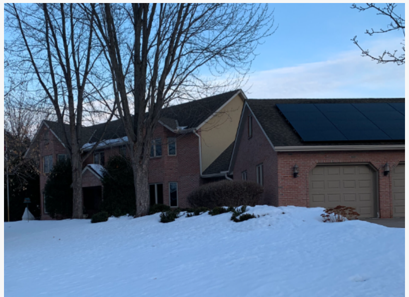
Wolf River Solar Installation Works in Winter