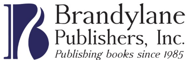
Brandyane Publishers's logo