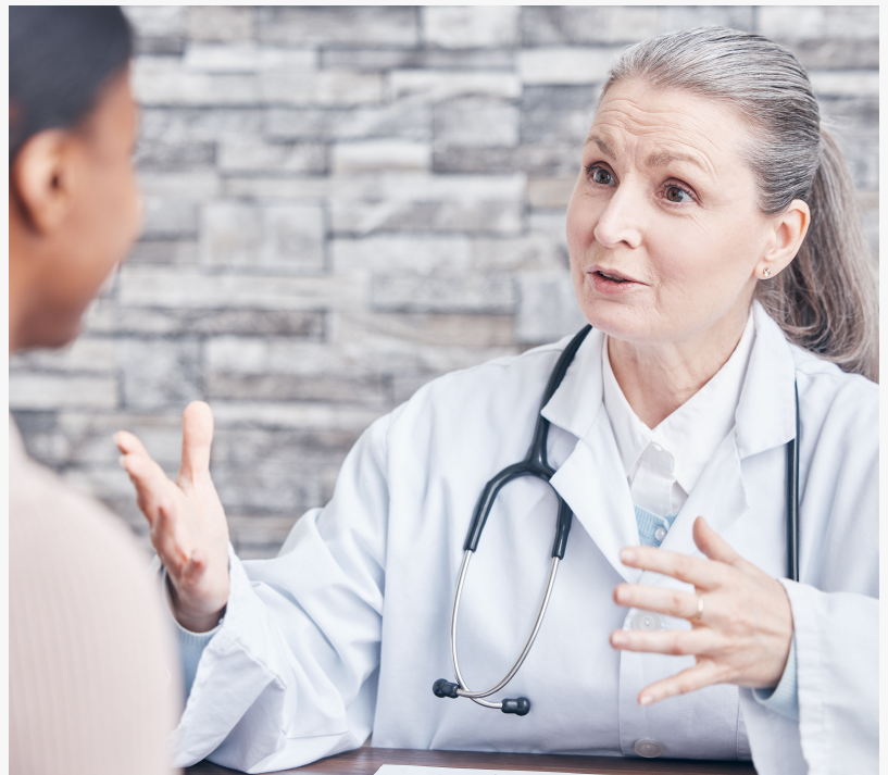
Figure 3 Physician Talking with a Patient About Using Medications to Treat Opioid Use Disorder