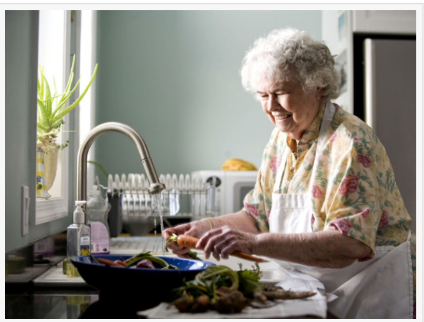
Home Alzheimers Care

Home Dementia Care: Tailored care plans for those with dementia, ensuring they receive the necessary support to maintain their quality of life.