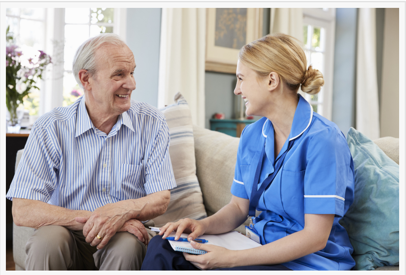
Home Dementia care

Home-Aid Caregivers offers top-tier home health care services in Tyler, TX. Located at 215 Winchester Dr Suite 106, Tyler, TX 75701, Home-Aid Caregivers provides a full spectrum of