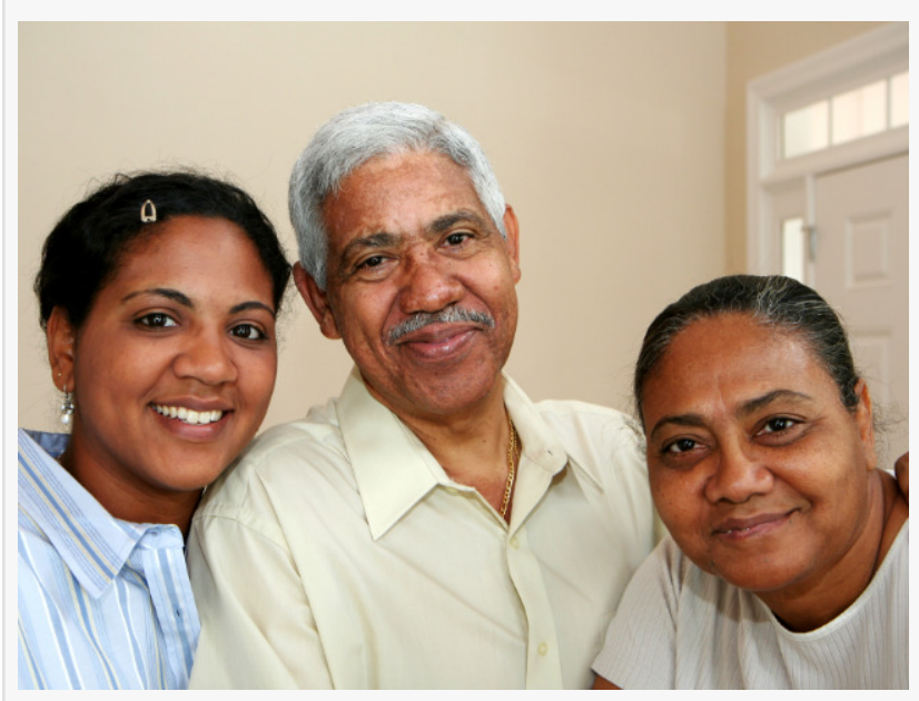
caregivers near me

care, including home healthcare, Alzheimer's and dementia care, private nursing, and 24-hour senior care.