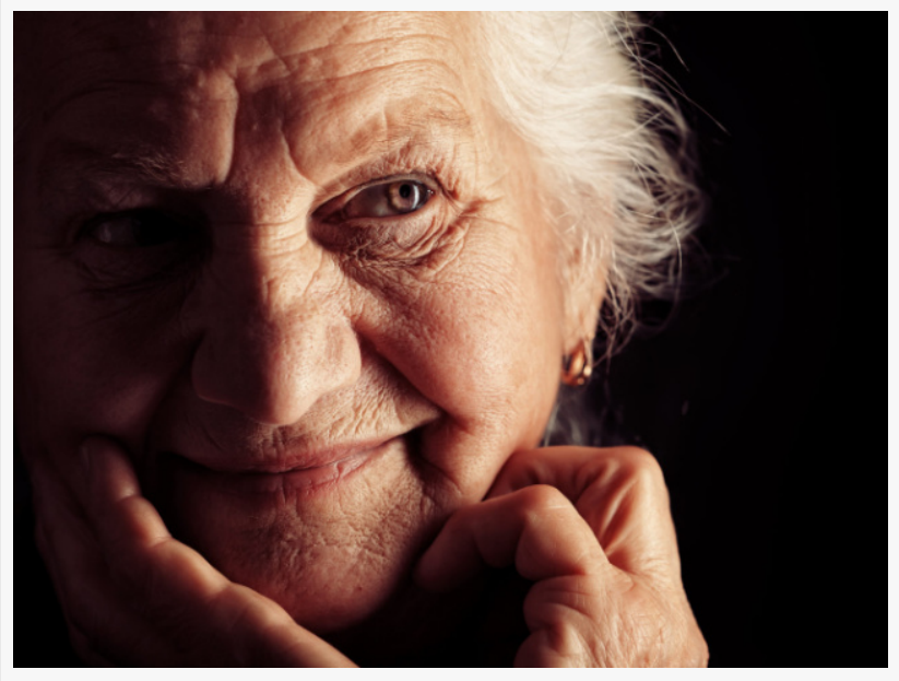
home health tyler tx

Private Home Nursing: Professional nursing services are provided in the home, offering medical care and support around the clock.