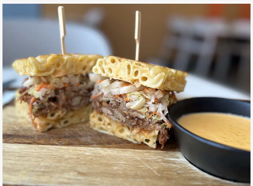
BBQ Pork Macwich

LOS ANGELES, CA, US, July 17, 2024 /EINPresswire.com/ -- The Carving Board , a beloved sandwich restaurant in Los Angeles, has been serving up delicious sandwiches for over 12 years. They are now thrilled to announce their latest menu additions which come in two delectable variations: the Mac & Cheeseburger and the BBQ Pork Macwich . This unique twist on American classics is sure to satisfy any craving for comfort food.