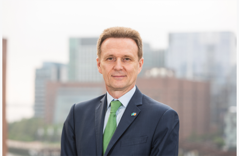
Pedro Azagra, CEO, Avangrid

About Avangrid: Avangrid, Inc. (NYSE: AGR) aspires to be the leading sustainable energy company in the United States. Headquartered in Orange, CT, with approximately $45 billion in assets and operations in 24 U.S. states, Avangrid has two primary lines of business: networks and renewables. Through its network business, Avangrid owns and operates eight electric and natural gas utilities, serving more than 3.3 million customers in New York and New England. Through its renewables business, Avangrid owns and operates a portfolio of renewable energy generation facilities across the United States. Avangrid employs approximately 8,000 people and has been recognized by JUST Capital as one of the JUST 100 companies – a ranking of America's best corporate citizens – in 2024 for the fourth consecutive year. In 2024, Avangrid ranked first among utilities and 12 overall. The company supports the U.N.'s Sustainable Development Goals and was named among the World's Most Ethical Companies in 2024 for the sixth consecutive year by the Ethisphere Institute. Avangrid is a member of the group of companies controlled by Iberdrola, S.A. For more information, visit www.avangrid.com .