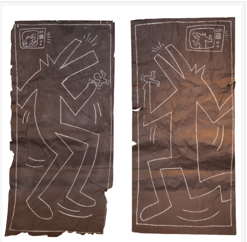
Chalk on paper by Keith Haring (American, 1958-1990), titled Dogs Eating Man.

Traditional furniture will feature a small