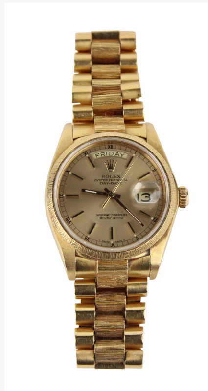
Rolex 18K President Oyster Perpetual Watch. Baton indices, "bark" center President bracelet and "bark" engraved bezel. Champagne dial. Approx. 36mm.