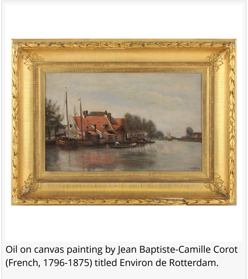
Oil on canvas painting by Jean Baptiste-Camille Corot (French, 1796-1875) titled Environ de Rotterdam.