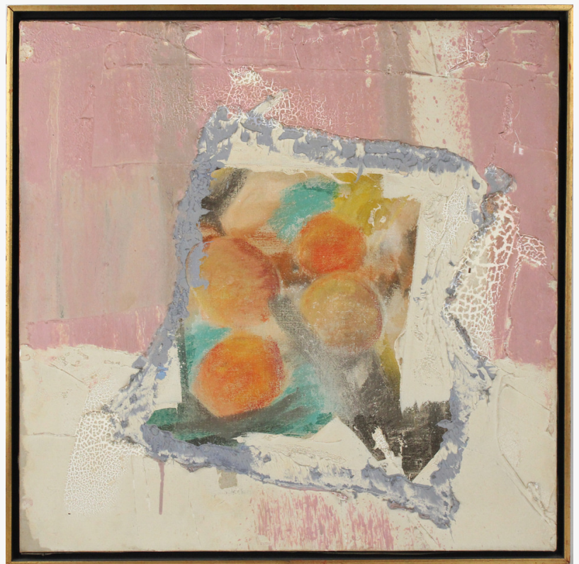
Oil on canvas painting by Michael Goldberg (1924-2008), titled Orange in Violet.