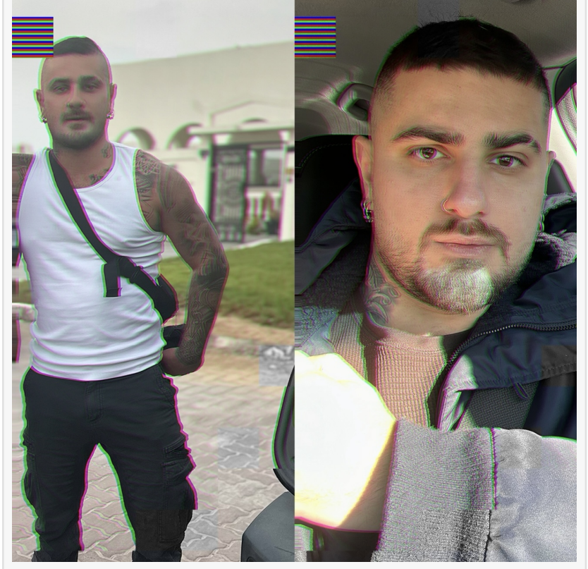
A recent pic of his Sober life!