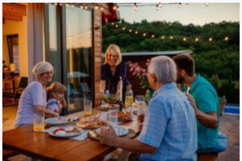
Enjoy Your Summer with Savings!

Texas Electric Service is dedicated to empowering consumers in Texas's deregulated energy