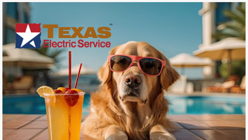
Stay Cool with Texas Electric Service!