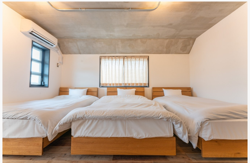
HOTEL GARO P4