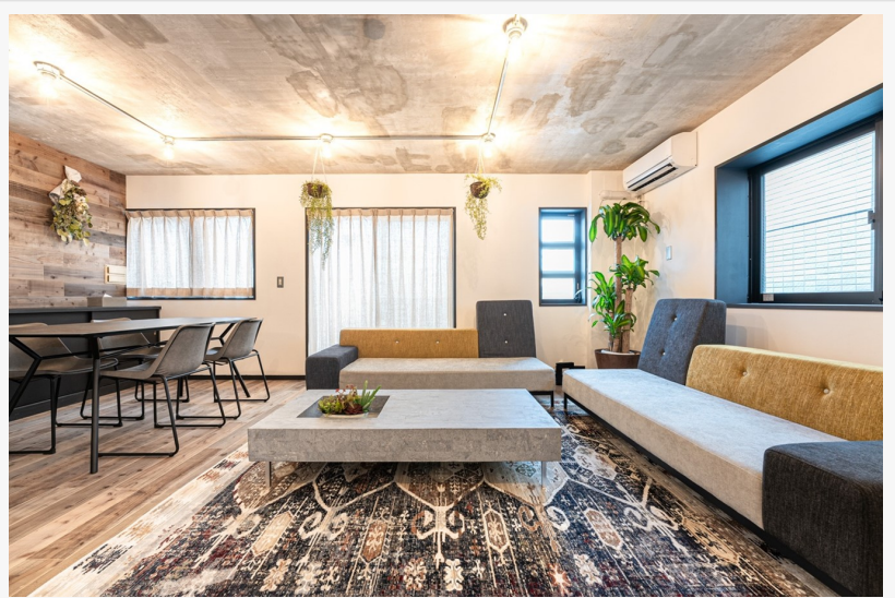
HOTEL GARO P3

Unit size: 174 square meters (3 bedrooms, 2 restrooms, and 1 bathroom with a bathtub)