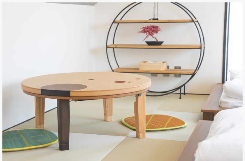
HOTEL GARO P5

Instagram: https://www.instagram.com/hotelgaro