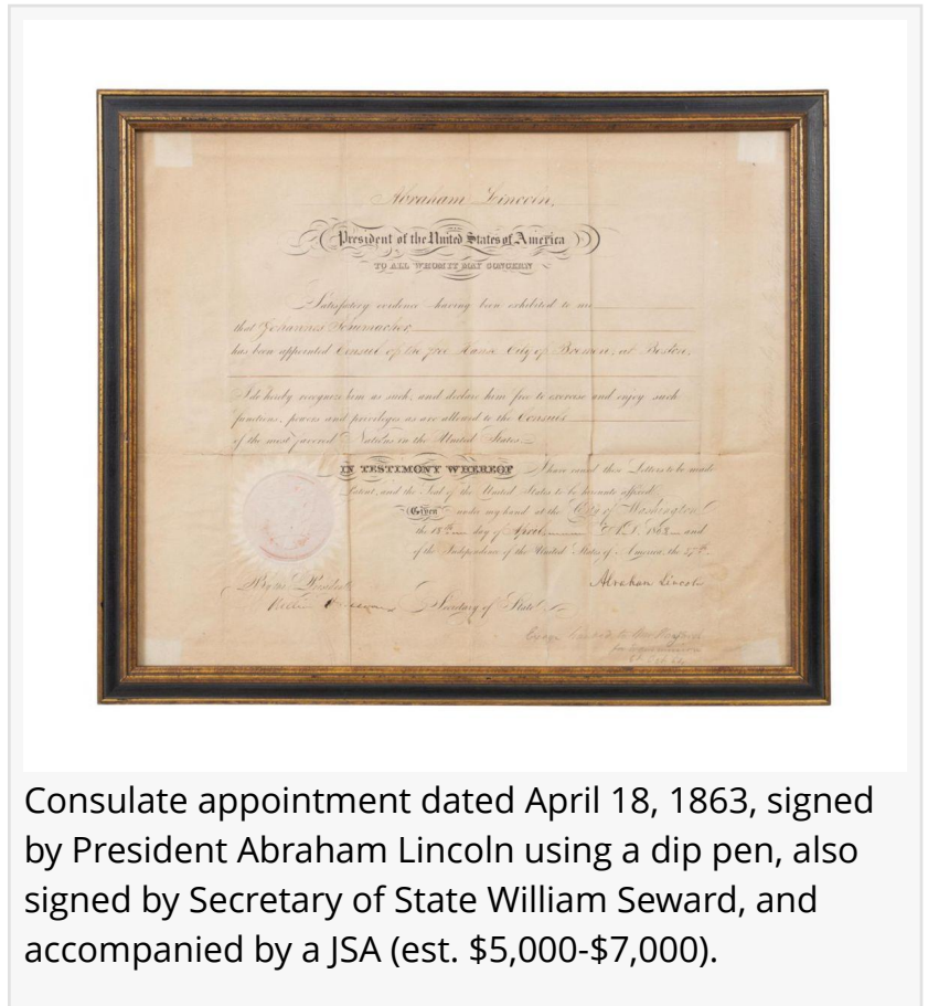
Consulate appointment dated April 18, 1863, signed by President Abraham Lincoln using a dip pen, also signed by Secretary of State William Seward, and accompanied by a JSA (est. $5,000-$7,000).