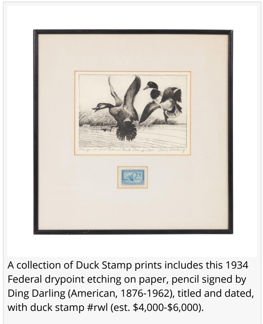
A collection of Duck Stamp prints includes this 1934 Federal drypoint etching on paper, pencil signed by Ding Darling (American, 1876-1962), titled and dated, with duck stamp #rwl (est. $4,000-$6,000).

Ahlers & Ogletree is a multi-faceted, family-owned business that spans the antiques, estate sale, wholesale, liquidation, auction and related industries. Ahlers & Ogletree is always seeking quality consignments for future auctions. To consign a single item, an estate or a collection, you may call them directly at 404-869-2478; or, you can send them an e-mail, at