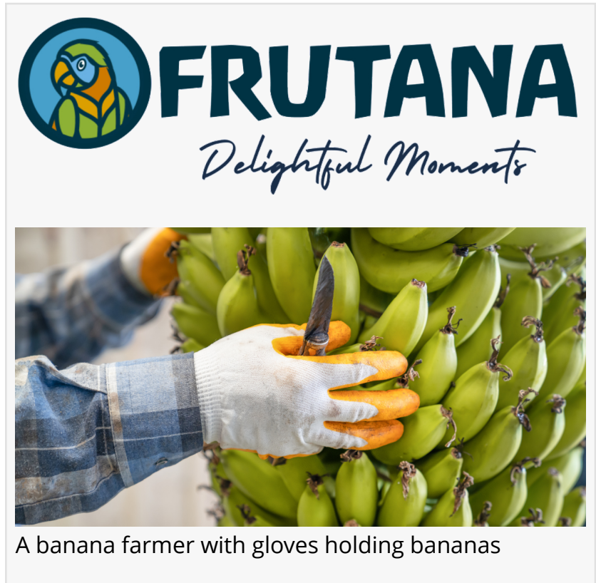
A banana farmer with gloves holding bananas