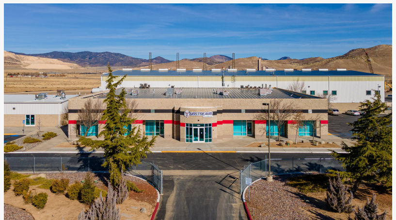
National Training Center

About Airstreams Renewables, Inc.: Airstreams Renewables, Inc. (ARI) is committed to transferring knowledge gained from years of experience in the renewable energy and telecommunication tower industry to its students. An ARI certificate ensures that holders meet or exceed necessary requirements for successful employment within the sectors our program focuses on. For more information about Airstreams Renewables, Inc., and their Renewable Energy and Communications Tower Technician Program visit Airstreams Renewables website.