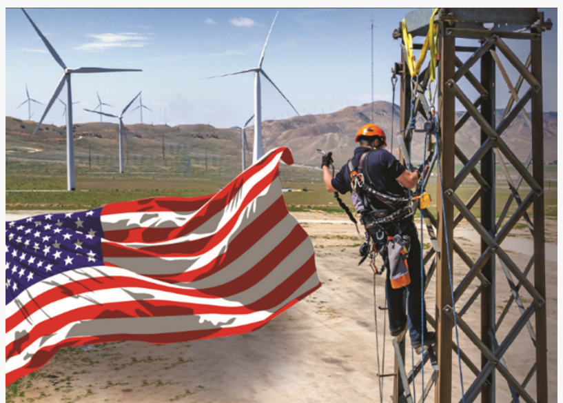
Climb To New Heights