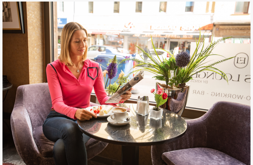
KING's Cafe Munich