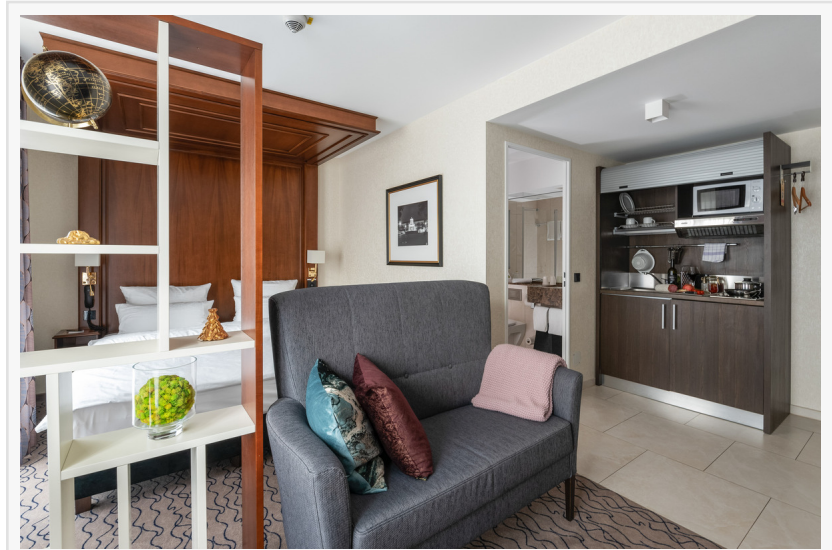
KING's Advastay Apartment

A family-owned boutique hotel group situated in central Munich, KING's Hotels Munich artfully combines luxury and practicality. Catering to all travellers, from solo adventurers to couples, families and on-the-move professionals, KING's offers both short and extended-stay