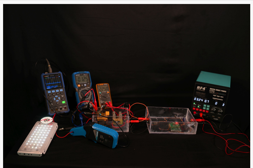
Prototype with AC and DC output