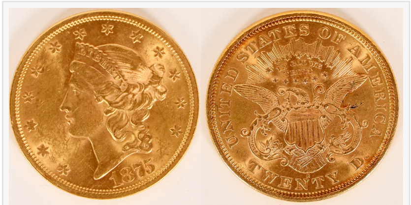
1875-S U.S. $20 Liberty Head gold coin, in Almost Uncirculated condition, from a total mintage of 1,230,000 coins (est. $2,500-$3,500).

RENO, NV, UNITED STATES, July 9, 2024 /EINPresswire.com/ -- Holabird Western Americana Collections, LLC will look to take some of the edge off of summer's sweltering heat with a cool, two-day Timeless Treasures Auction on Saturday and Sunday, July 13th and 14th. The online-only event is loaded with 1,584 lots of numismatics , Western Americana, postal history and more. Online bidding will be provided by iCollector.com .