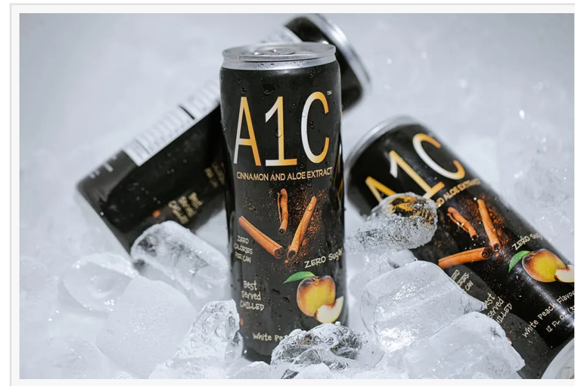
A1C - The Best Tasting, Healthy Beverage for Adults and Children

In addition to expanding its reach, A1C Drinks is also launching a new Kid's Club version of its popular beverage. This new drink is specially formulated to meet the needs of young consumers, offering a tasty and nutritious beverage option with no sugar, zero calories, no red dye, or zero caffeine. Loaded with vitamins and a taste kids love, the A1C Kid's Club drink is set to become a favorite among parents and children alike.