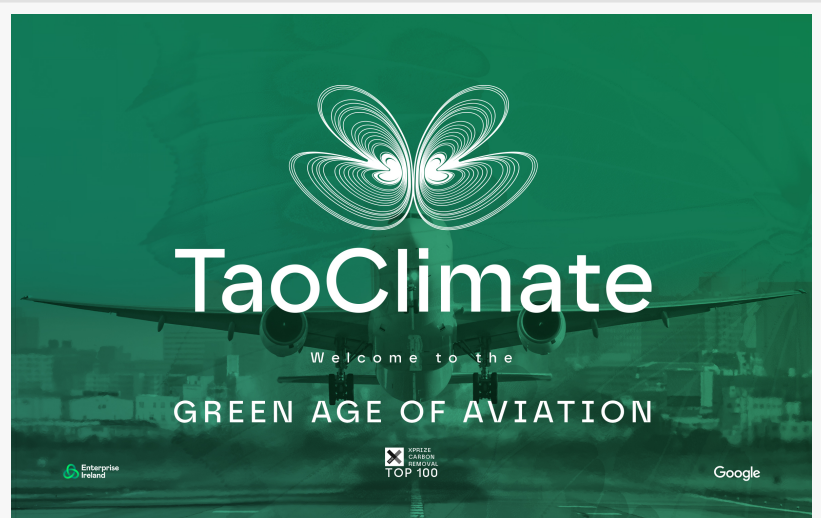
Tao Climate delivers the Green Age of Aviation