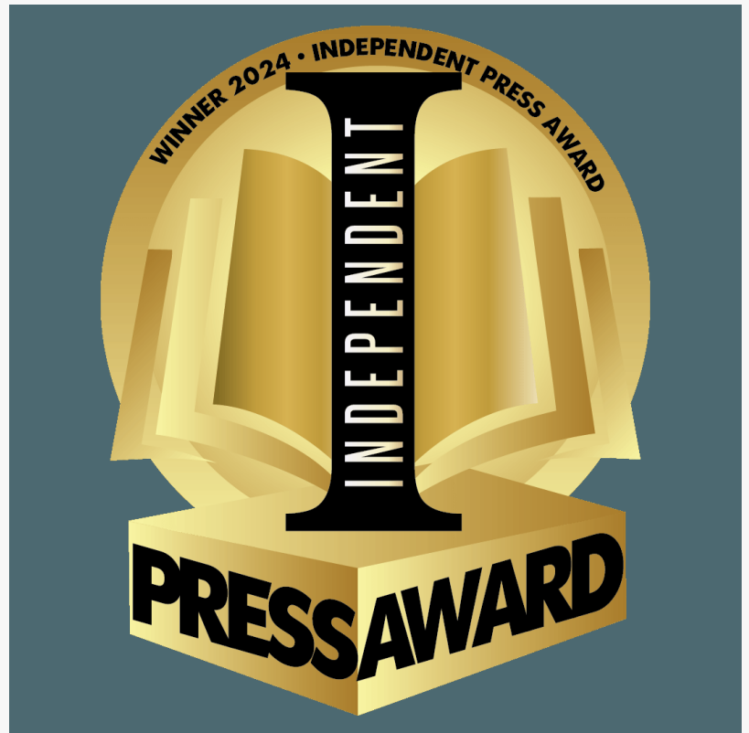
2024 Independent Press Award Winner