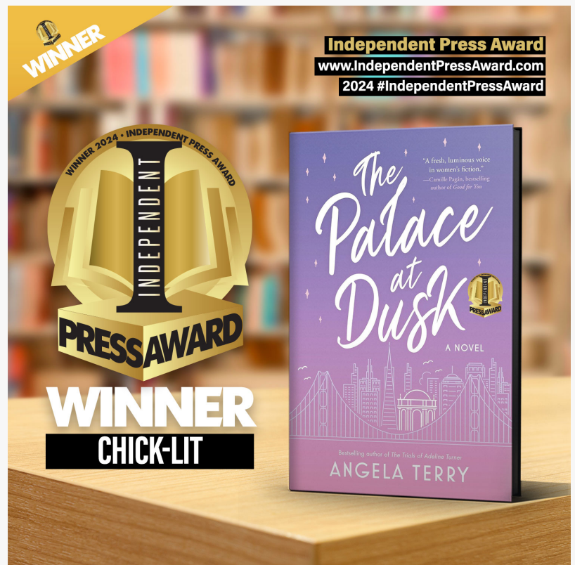
Independent Press Award 2024 Winner Award Banner