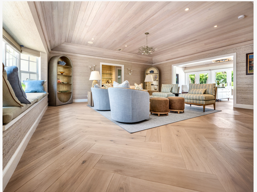
2023 Luxe RED Award winner for Best Flooring