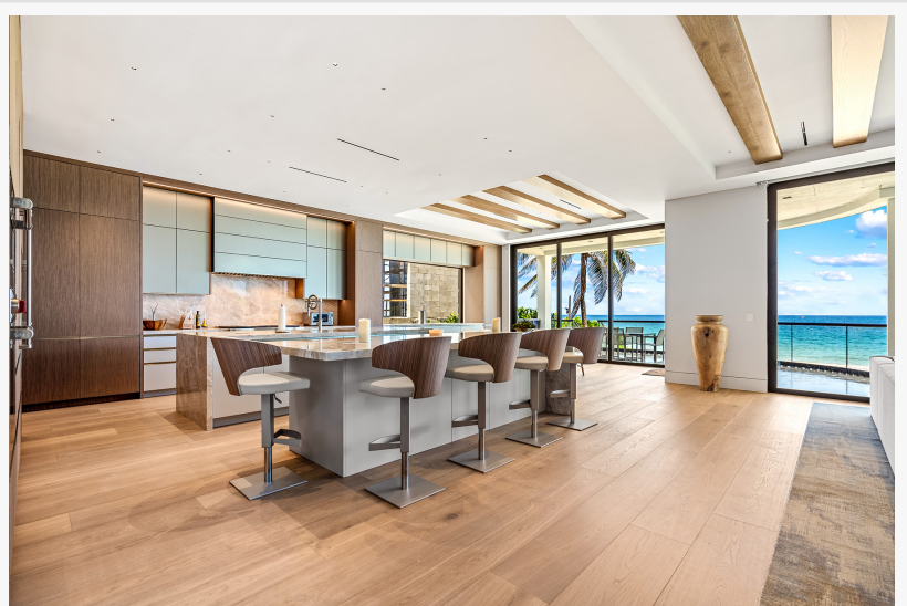
2022 Luxe RED Award winner for Best Flooring

In today's market, luxury homebuyers prioritize properties that offer a seamless integration of cutting-edge technology, elegant design, and quality materials. They expect stylish spaces enhanced with smart home features for optimal levels of convenience and security, complete with the timeless appeal of materials like marble and European hardwood.