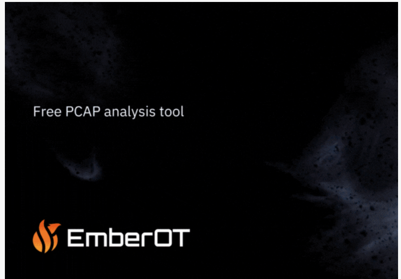
OT PCAP Analyzer Product views

EmberOT - Visibility and Security for Critical Infrastructure