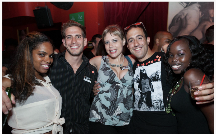
Single and the City's "Rescue Me" First Responder Singles Party