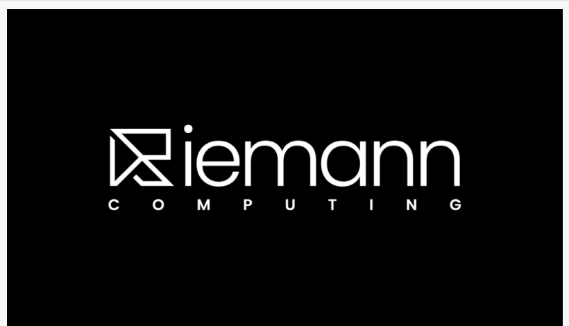
Riemann Computing Banner Image

Self-sustaining cities are the future. We have enough food on the planet where people can probably eat over 6000 calories each + surplus, but still struggle from world hunger. We can design bioethical herbicides, self-sustaining grids, and be a light to the world through advocacy. The founder of Riemann Computing Inc. has a heart for Africa, being a Copt, holding the Eb1b gene, and being related to King Solomon, he looks at Ethiopia as the most beautiful country in the world along with Egypt, and calls Africans his brothers. Africa has been unfortunately riddled with corruption, foreign interests trying to destabilize regions, yet you have some of the happiest and kindest people there. Contradictory to what is said in the west, Africa is a no-nonsense region with the world's brightest, most resilient, and faithful people.