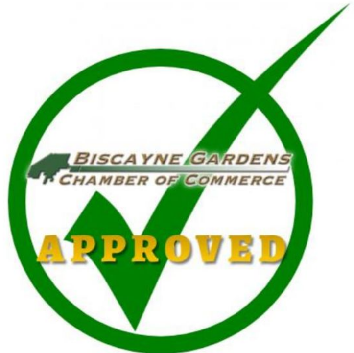
Biscayne Gardens Chamber Approved