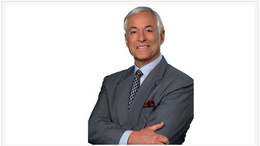
Brian Tracy – Speaker, Author, Consultant, and father of four children