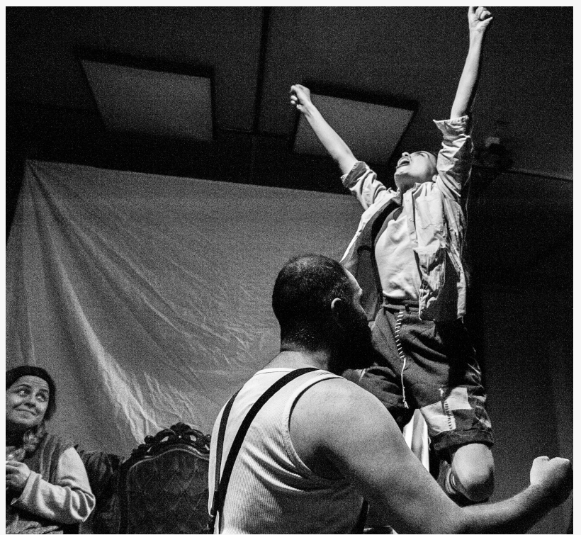
"My Heart's in the Highlands" performed by Hangardz.

Armenian theater artists who gathered around a shared dream to perform theater in their native language, Western Armenian, and to reflect universal theater values along with their local motifs and colors. The ensemble was founded under the name 'hangardz', meaning 'suddenly', which conveys how they embarked on the journey for independent theater performed in Western Armenian. Hangardz debuted on World Theater Day in 2018 with their play "Mer Çunetsadzi İrarmov Kidnenk" [Let's Find in Each Other What We Don't Have] at the Synergy World Theater Festival in Serbia.