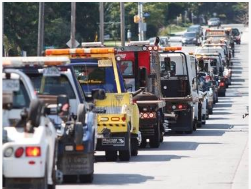
Ensure defects are dealt with quickly to reduce downtime