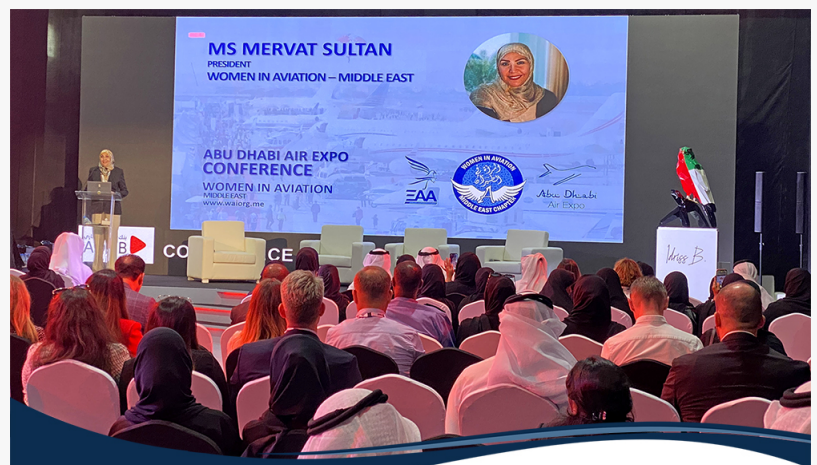
Women in Aviation