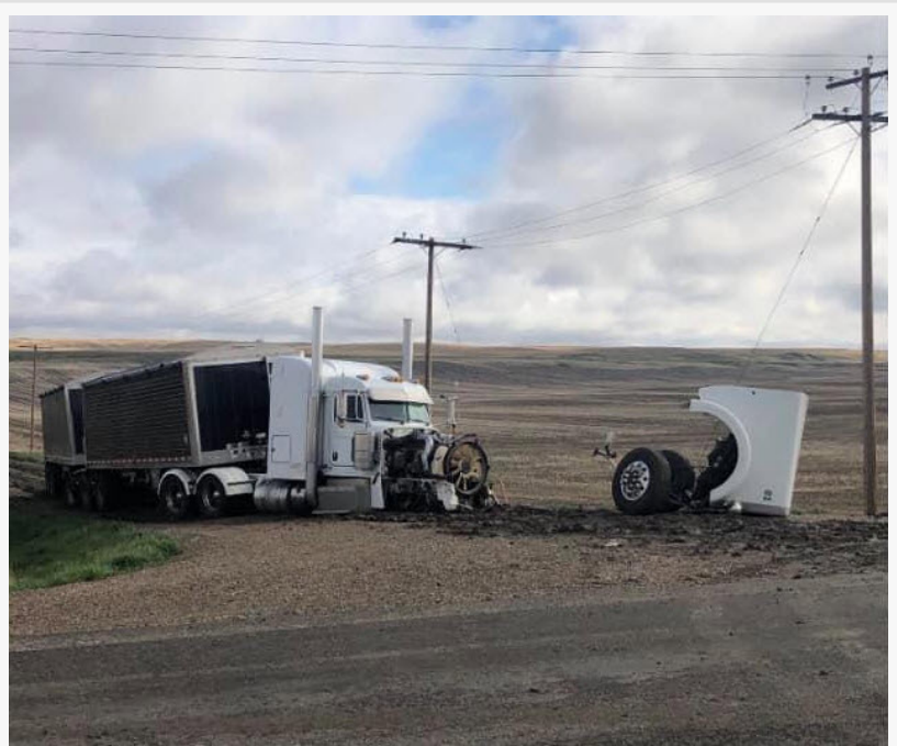
A little maintenance can go a long way

EDMONTON, ALBERTA, CANADA, July 4, 2024 /EINPresswire.com/ -- When it comes to commercial vehicle inspections, selecting a trusted and reliable shop is paramount. It's not merely about ticking off a checklist—it's about ensuring the job is done right and all defects are adequately addressed. Cutting corners to achieve a quick turnaround can lead to disastrous consequences, impacting both safety and business operations.