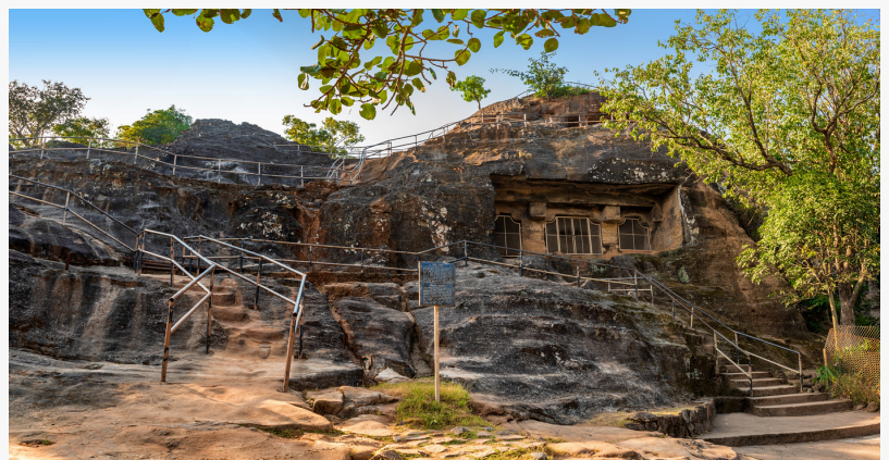
The Pandav Caves of Pachmarhi, an Ancient Wonder