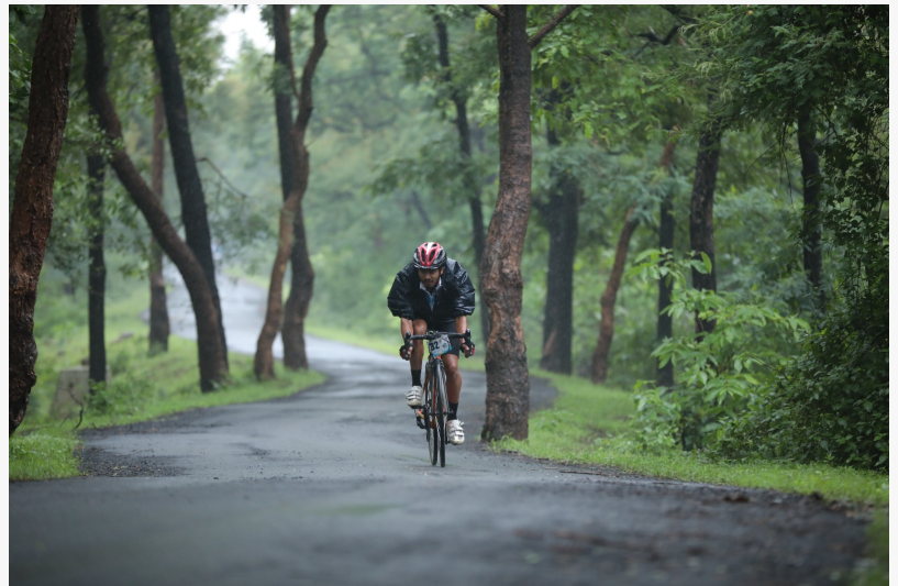
A Scenic Cycling Expedition Through the Satpura Mountain Range