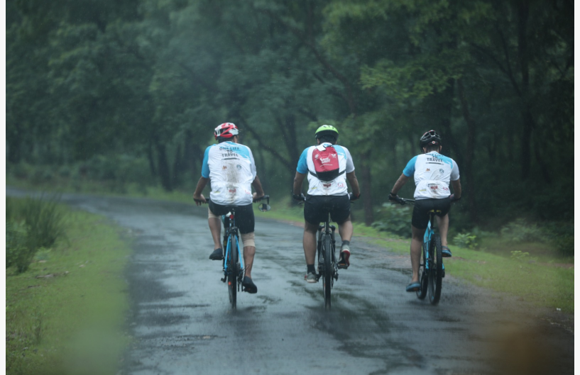
An Epic Ride through Nature's Splendor

Madhya Pradesh, often referred to as the "Heart of Incredible India," is renowned for its