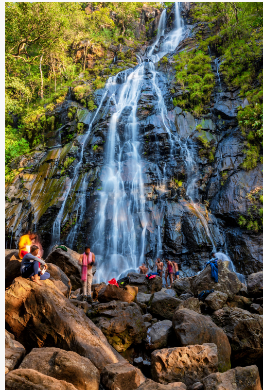
The Enchanting Bee Fall: Pachmarhi's Natural Gem