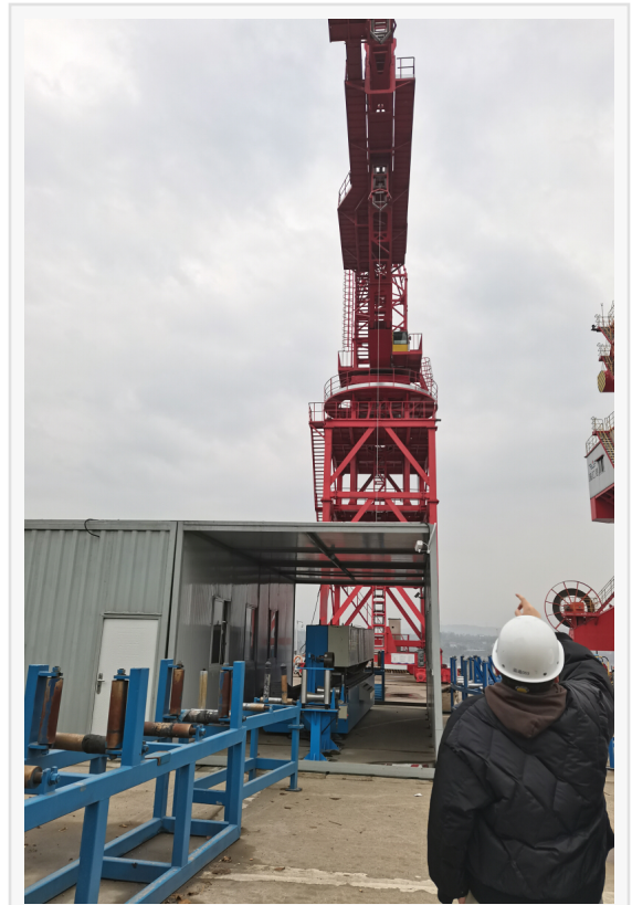
ZMS Cable Manufacturing Equipment

ZMS employs a rigorous manufacturing process to produce these high-performance submarine