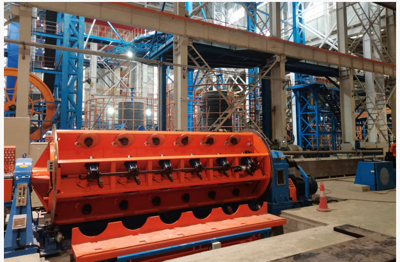
ZMS Cable Production

The project involved the manufacture and supply of 7,000 meters of submarine cable by ZMS Cable . These cables are constructed with a complex and robust design: CU/XIPE/CWS/Poly-AL