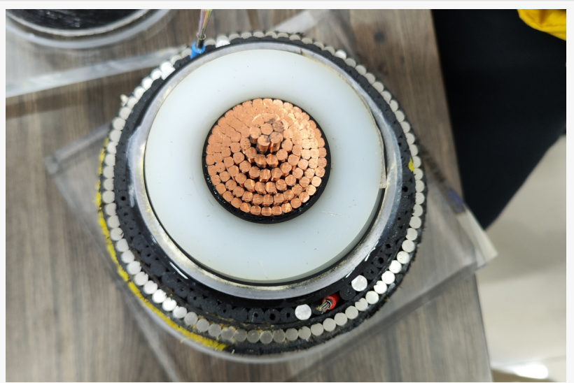
Sample of ZMS Submarine Cable

ZMS has been at the forefront of submarine cable technology for many years, with a track record of supplying over 53.8 kilometers of submarine cables globally. For the Osogbo/Olorunsogo project, ZMS Cable was involved in every stage, from the structural design of the submarine