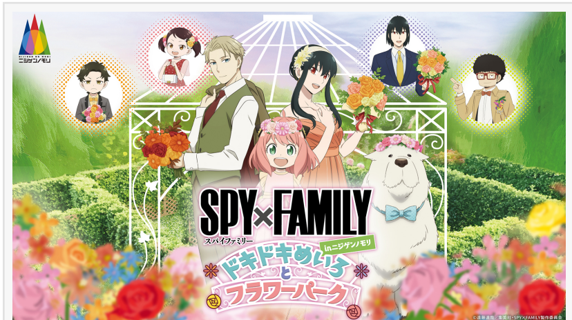
SPY×FAMILY in Nijigen no Mori: DOKIDOKI Maze and Flower Park

Location: "SPY×FAMILY in Nijigen no Mori: DOKIDOKI Maze and Flower Park"