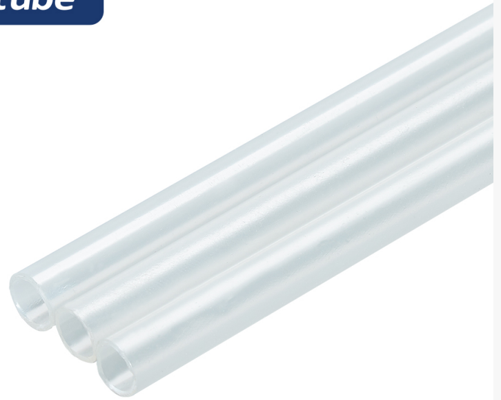
Clear PVC Electrical Conduit