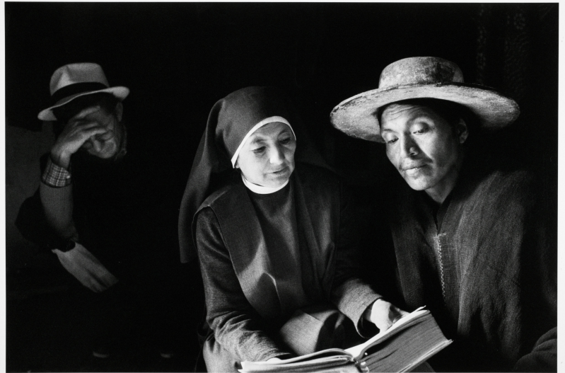
Sebastião Salgado (1982 grant recipient), of Brazil, spent seven years documenting the lives of villagers in Peru, Bolivia, Ecuador, Mexico and Guatemala and published the work in a book titled: "The Other Americas."

EINPresswire.com/ -- The W. Eugene Smith Fund announced it is now accepting applications for its 45th annual Grant in Humanistic Photography with a top prize of $30,000. An additional $10,000 grant will be awarded as a Fellowship, and one Finalist will be deemed worthy of special recognition and presented with a $7,500 grant. The Smith Fund is also accepting applications for its 7th annual Eugene Smith Student Grant, which will honor the top student entry with a $5,000 grant. The student grant is open to all collegiate-level students currently enrolled in full-time or part-time programs, including graduate studies.