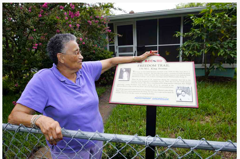
A Marker along the Accord Freedom Trail in St. Augustine

ST. AUGUSTINE , FL, US, July 1, 2024 /EINPresswire.com/ -- St. Johns County is the location of the Florida Museum of Black History, as recommended by the Florida Museum of Black History Task Force after its meeting on June 28, 2024, where the Task Force voted 6-1 to formally transmit this recommendation to the Governor and the Legislature. The County's Office of Public Affairs produced a video for this special announcement.