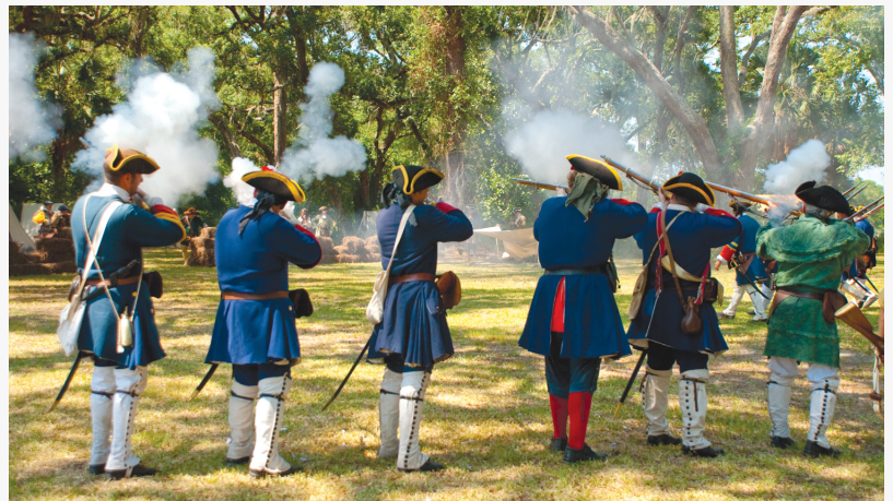
Fort Mose Historic State Park is the site of the First Free Black community in North America. 16th century runaway slaves would flee to Spanish Florida for their freedom.

The Florida Department of State's Division of Historical Resources notified St. Johns County on