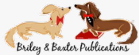
Briley & Baxter Publications