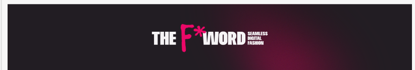
The F* Word, Seamless Digital Fashion