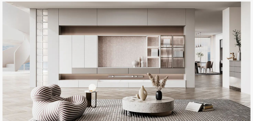
Oppein modern minimalist grey and white full house furniture