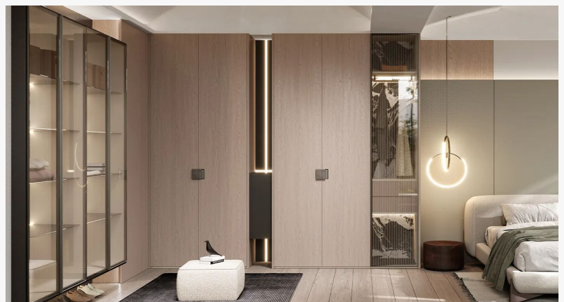
Oppein modern wooden full house furniture with zen aesthetics