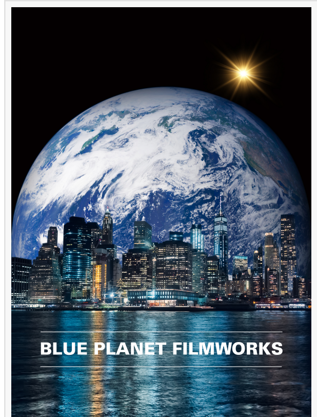
Blue Planet Filmworks