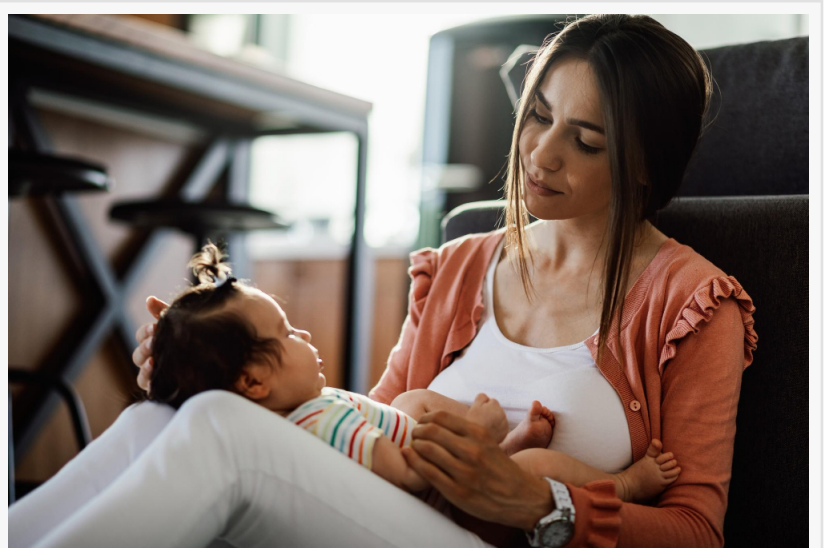
Lactation Consultant - Certified Lactation Counselor Los Angeles

LOS ANGELES, CA, UNITED STATES, July 11, 2024 /EINPresswire.com/ -- Speak Live Play, a leading provider of in-home speech and feeding therapy in Los Angeles, is excited to announce the addition of two new service offerings: Physical Therapy and Lactation Counseling. These expansions reflect their commitment to more comprehensive, family-centered care and dedication to meeting the diverse needs of their patients and their families.