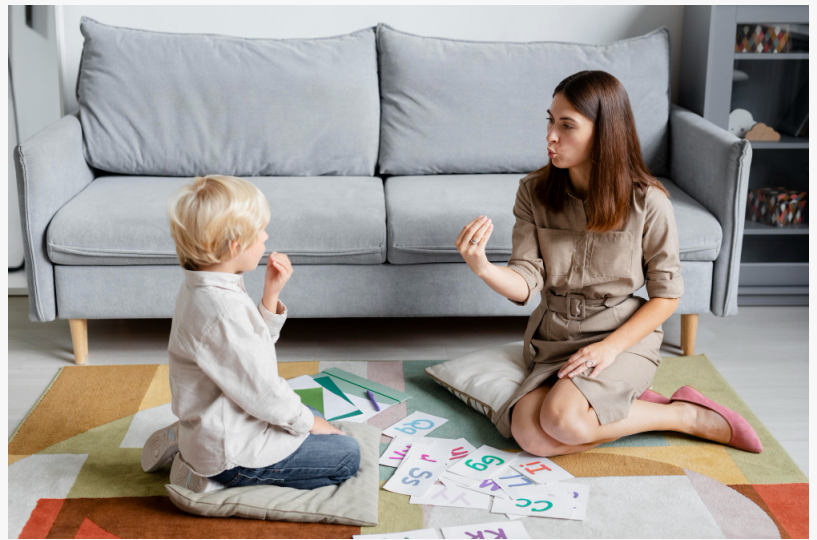
Speech Therapy Los Angeles