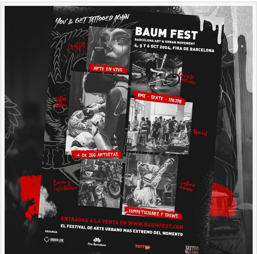
Baum Fest Flyer