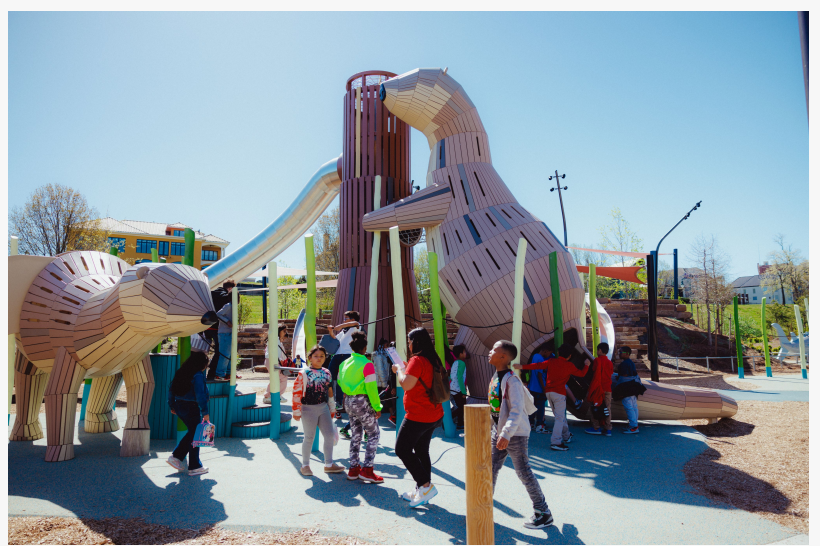
The Life on the River playground in Tom Lee Park was named one of the 11 Most Unique Playgrounds in the U.S. by Mental Floss

Founded in 1899, ASLA is the professional association for landscape architects in the United States, representing more than 15,000 members. Landscape architects lead the planning, design and stewardship of healthy, equitable, safe and resilient environments.