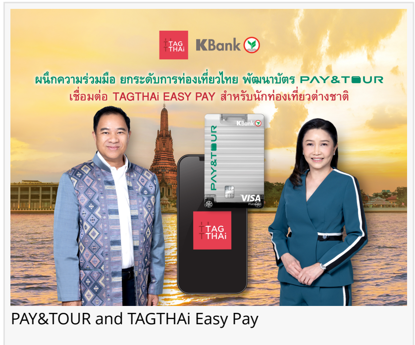
PAY&TOUR and TAGTHAi Easy Pay

tourists are expected to visit Thailand in 2024. Recognizing the importance of promoting sustainable growth in the Thai tourism industry, KBank has teamed with the TAGTHAi application