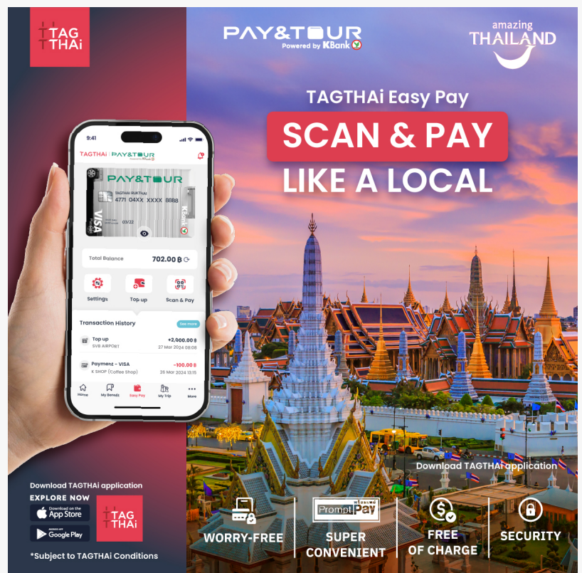
PAY&TOUR and TAGTHAi Easy Pay